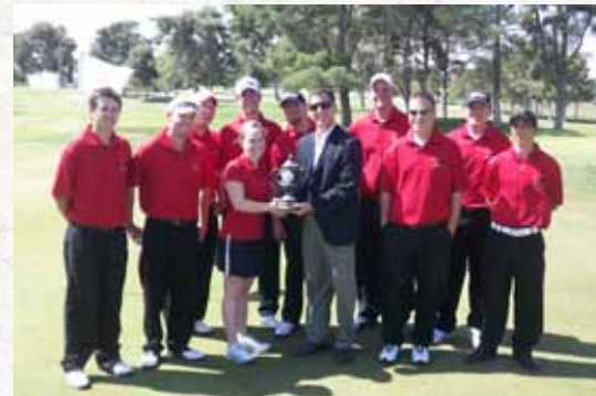
Trophy Presentation at the 2008 Director's Cup

The PGA Golf Management program staff includes a director who recruits, advises and instructs students as well as administers the program within the guidelines of UNLV and the PGA of America. An internship coordinator assists with these duties and organizes, plans, and facilitates students' internship experiences. Support staff assists with the administration of the program while providing guidance and support to all PGA Golf Management students.