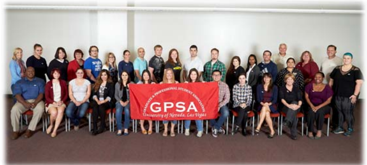
GPSA 2015—2016 Council