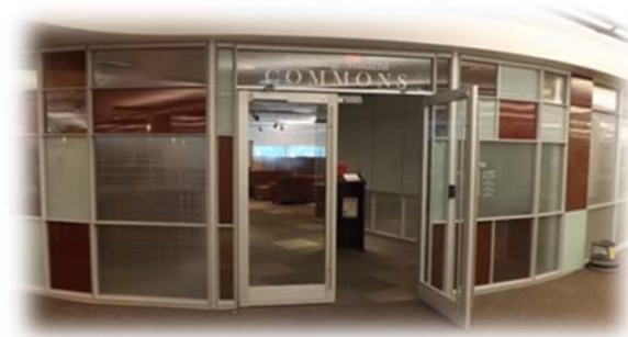
Graduate Student Commons located on the 2nd floor of the Lied Library

Computer software in the Commons is applicable to graduate and professional student studies: Adobe Suite, ArcGIS, Atlas.ti, AutoCad, Autodesk, Creative Suite, Crystal Reports, Microsoft Office, SAS, SPSS, Stata and Visual Basic.