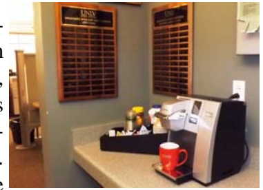
Keurig coffee maker— K-cups $1.00 each

The Graduate Student Commons is a perfect study refuge for your end-of-the semester studies. Come visit us in Graduate Student Commons, Lied Library room 2141. This state of the art facility is equipped with a copier, fax, flatbed scanners, color laser printer, 2 black & white laser printers, office supplies, 38 PCs, 6 Macs and wireless access, 5 large LCD touch screen panels, whiteboards, a small kitchen, a meeting room for group study—make your reservations with the office staff. The Commons also has a large plotter to print large posters for your conference presentations. The printing cost comes directly off of your RebelCard. The GPSA also sells a variety of snacks, tea and coffee for nominal prices.